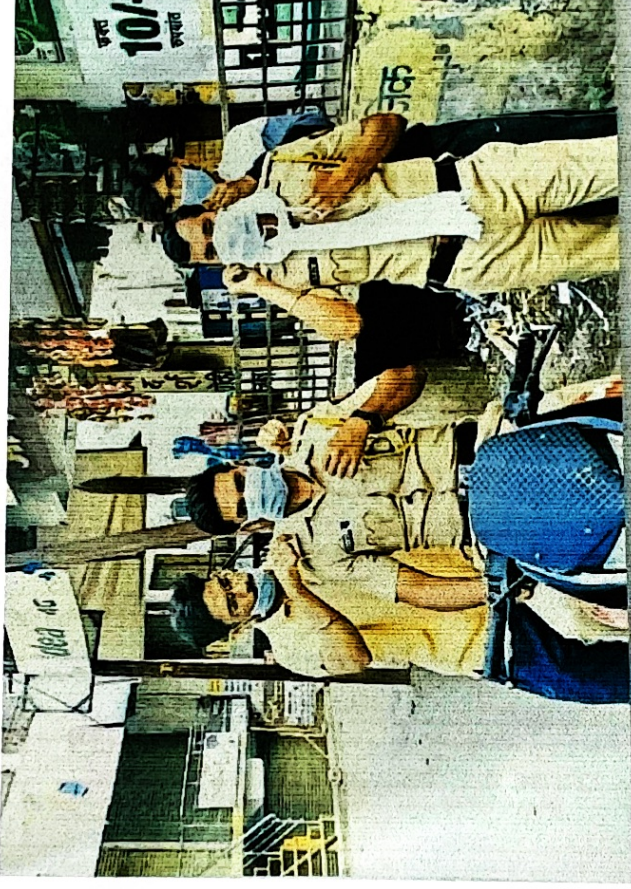
Mass distribution at the police Station.Pusad COVID-19