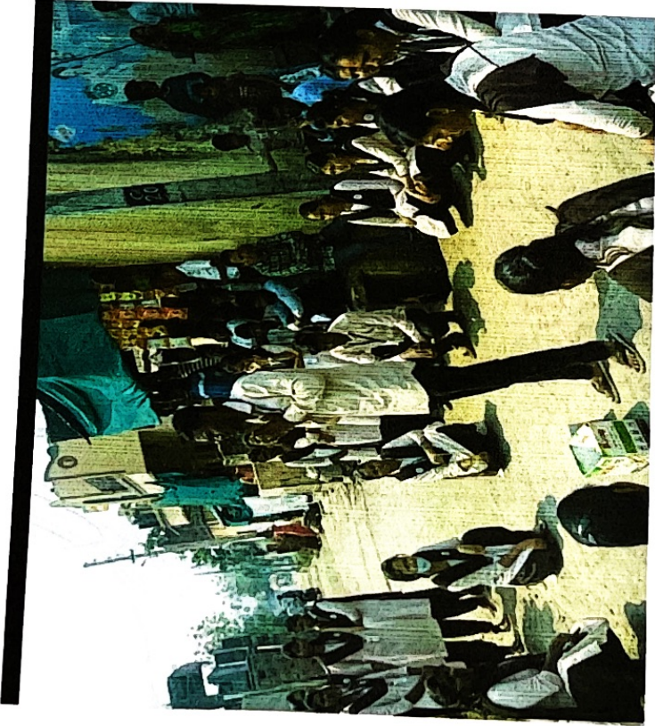
Cleanliness awareness Campaign Roll-play Kharshi