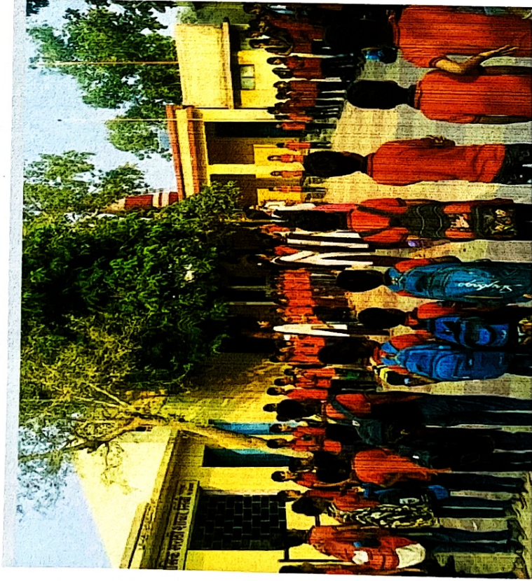
Cleanliness awareness Campaign Roll-play Limbe