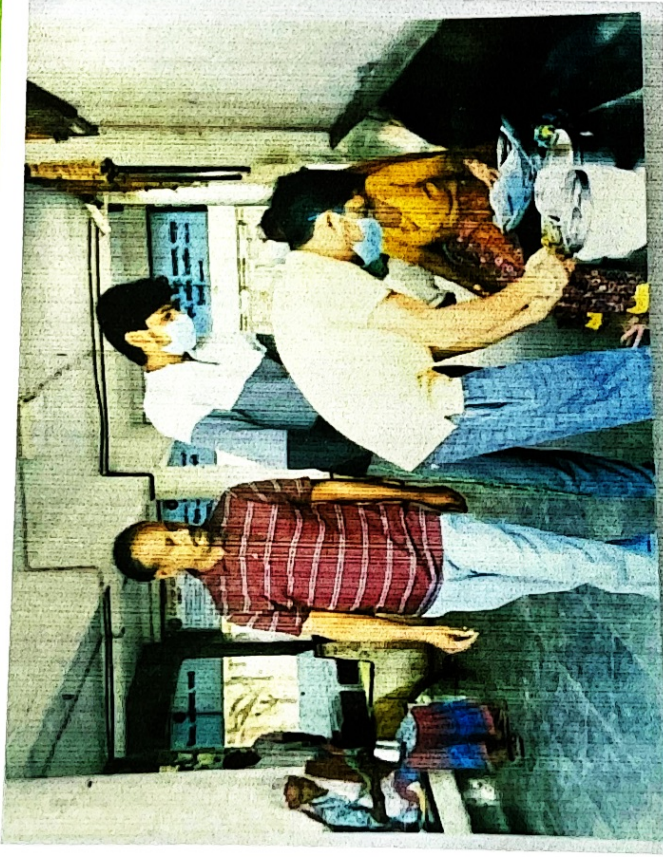
Food distribution at the P.H.C.Pusad COVID-19