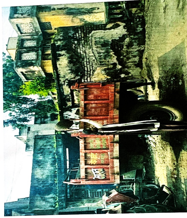
Cleanliness awareness Campaign in College campase