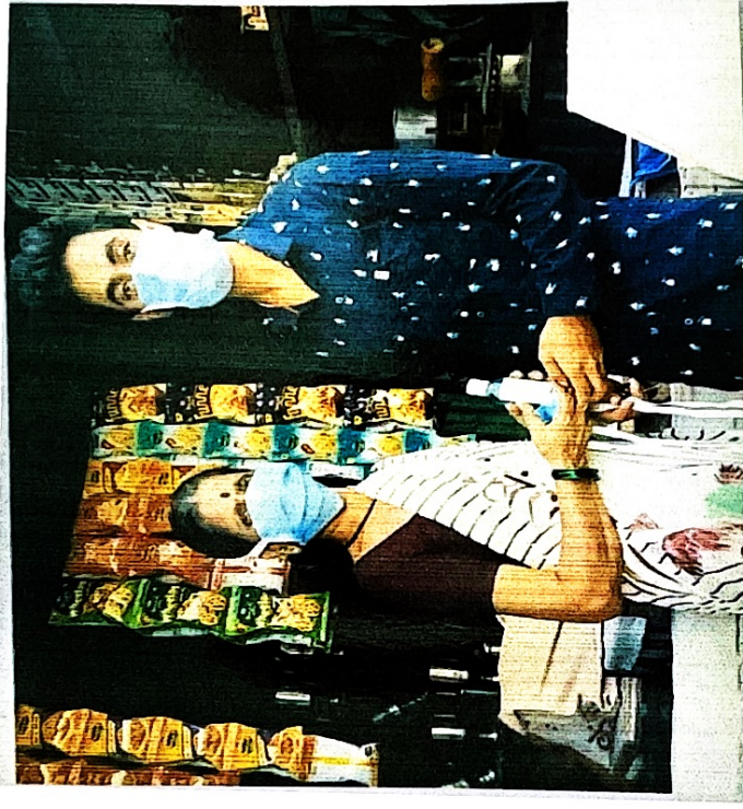
Mass distribution at .Pusad COVID-19