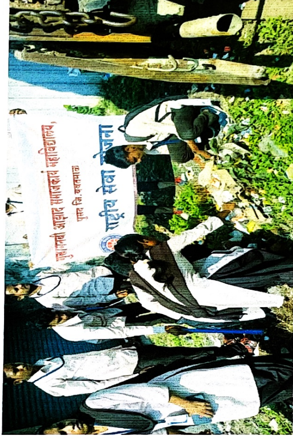
Cleanliness awareness Campaign NSS Student