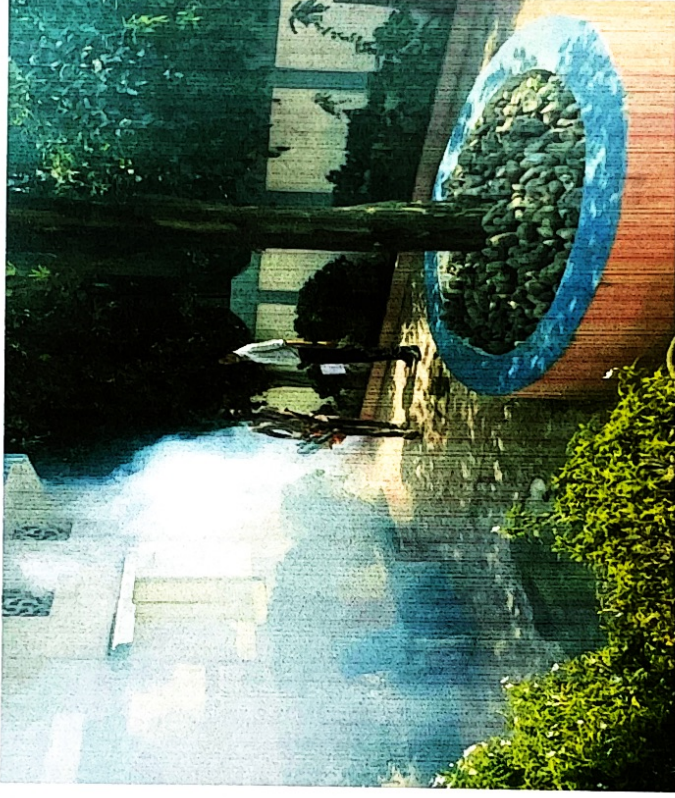
Fogging machine Health & Hygiene