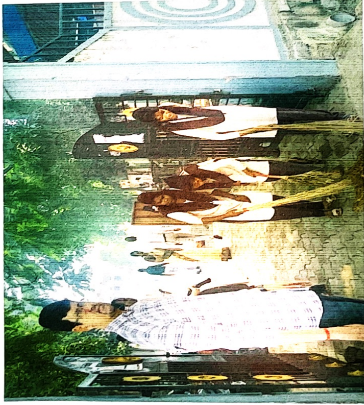
Cleanliness awareness Campaign in College campase