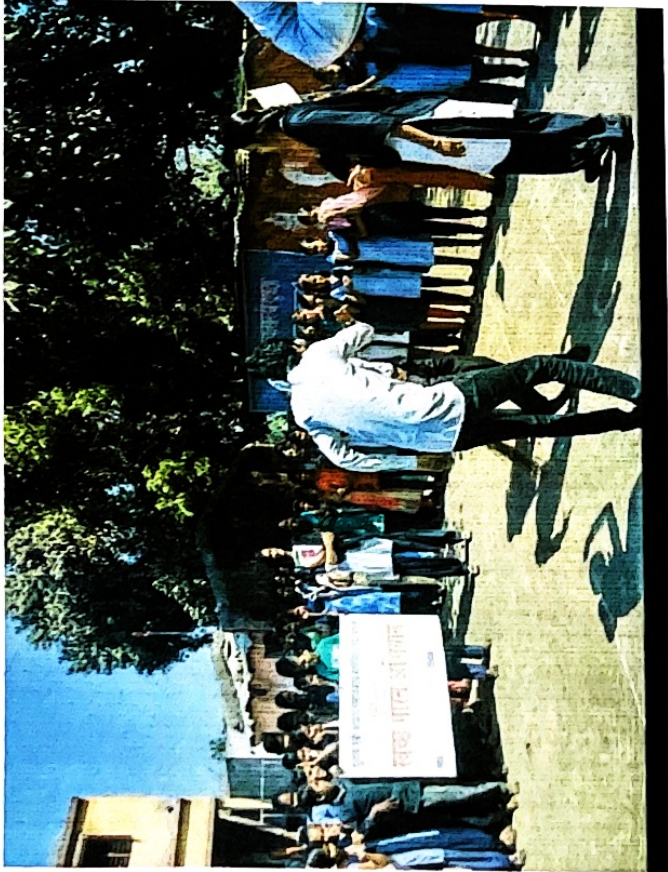
Cleanliness awareness Through Roll - Play