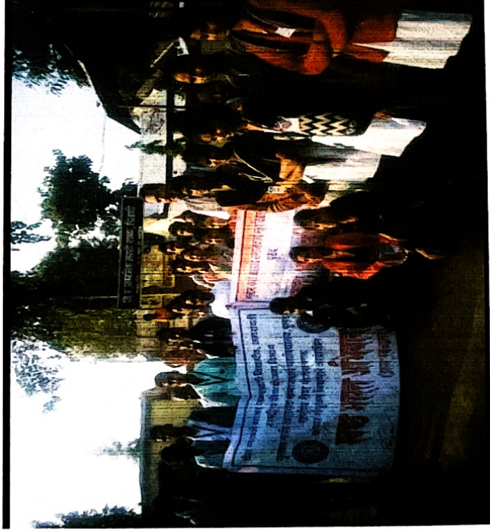
Cleanliness awareness Campaign at Kharshi