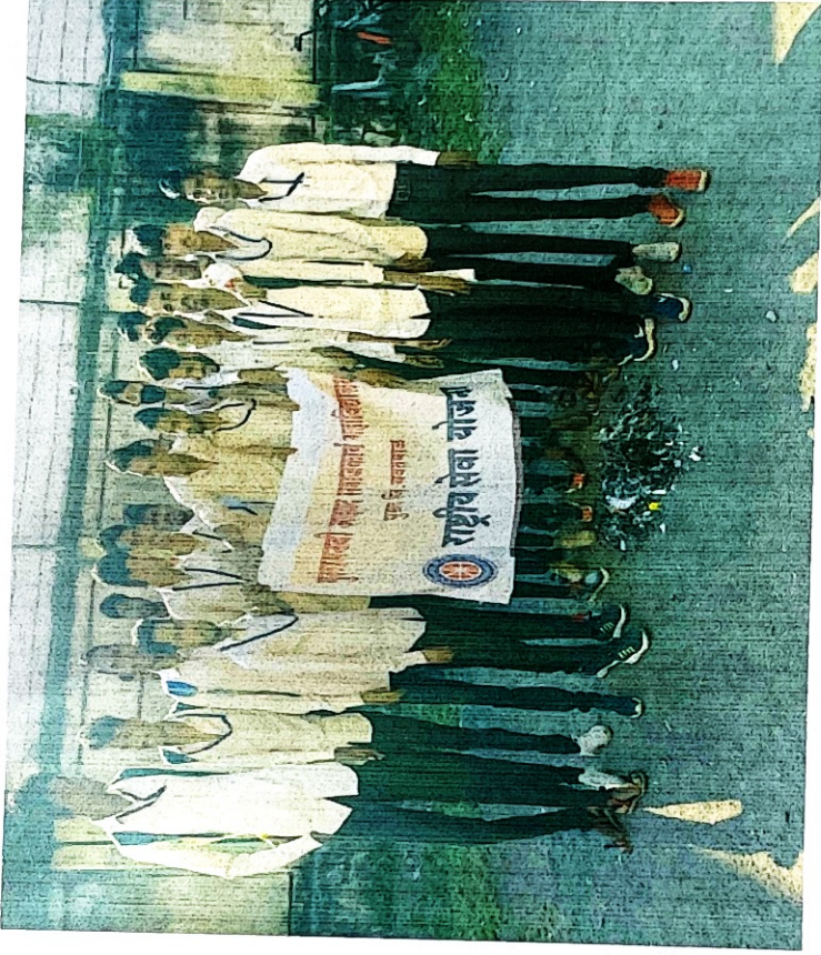
Cleanliness awareness Campaign NSS Group Activity