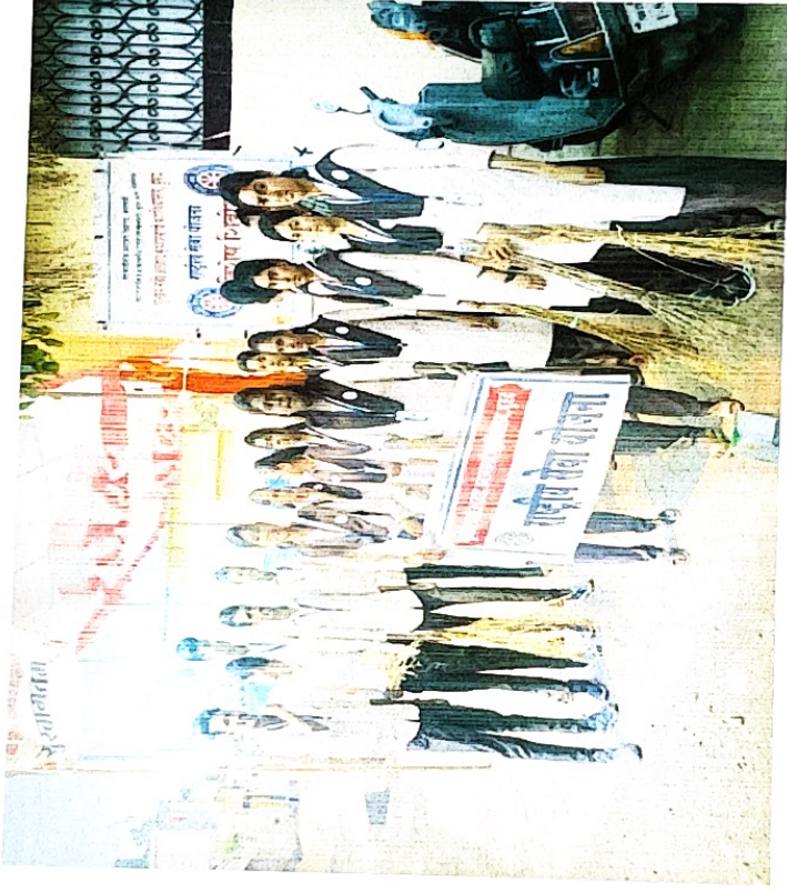
Cleanliness awareness Campaign Borgadi