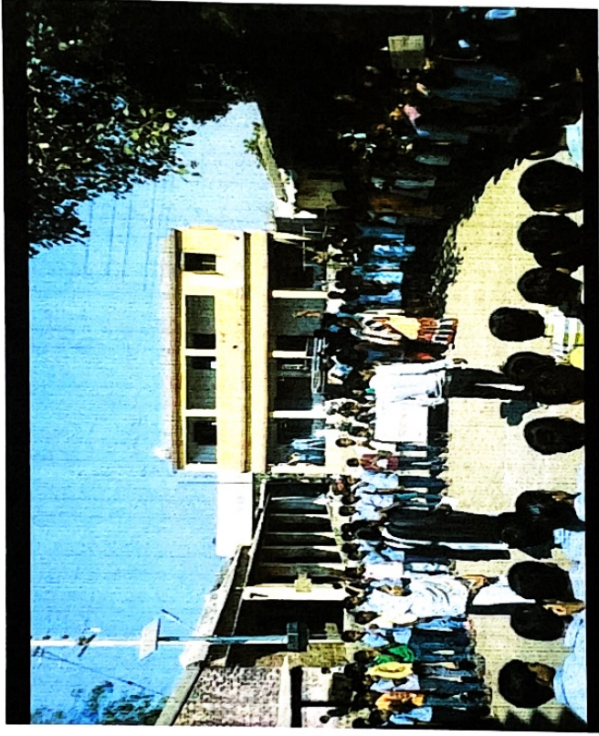
Cleanliness awareness Through Roll - Play