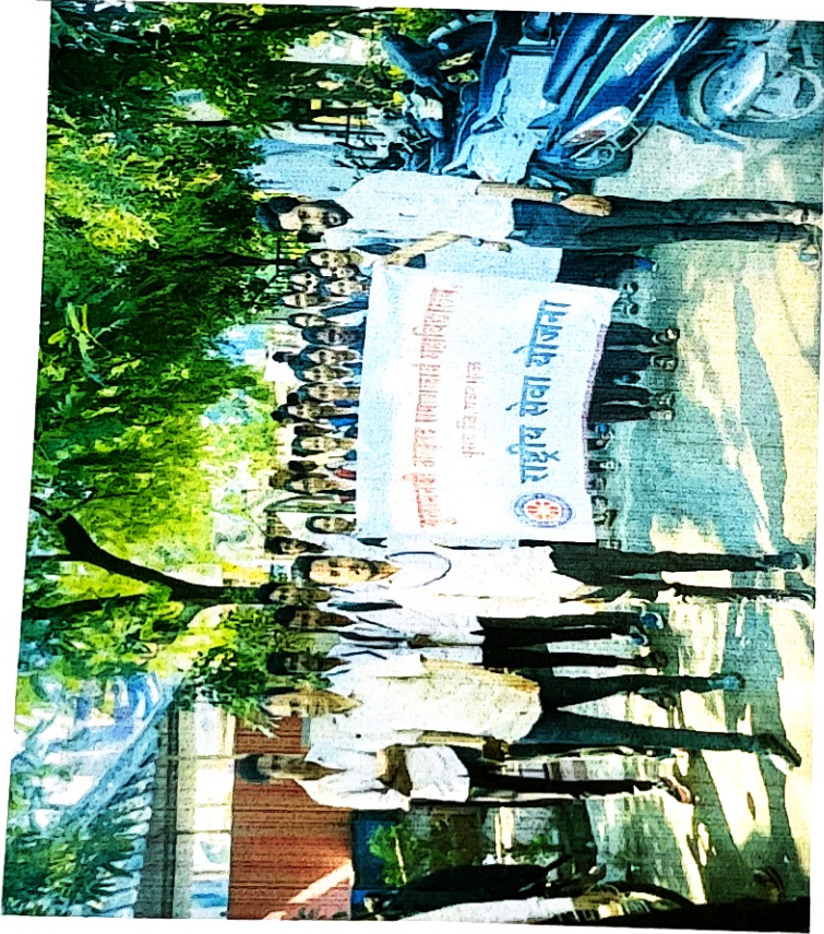
Cleanliness awareness Campaign NSS Rally