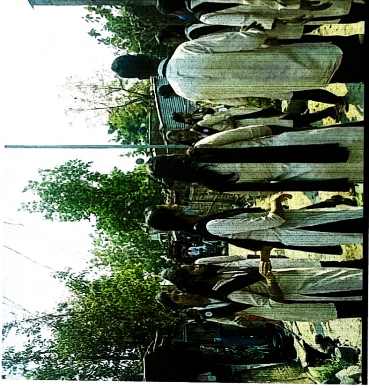
Cleanliness awareness Campaign