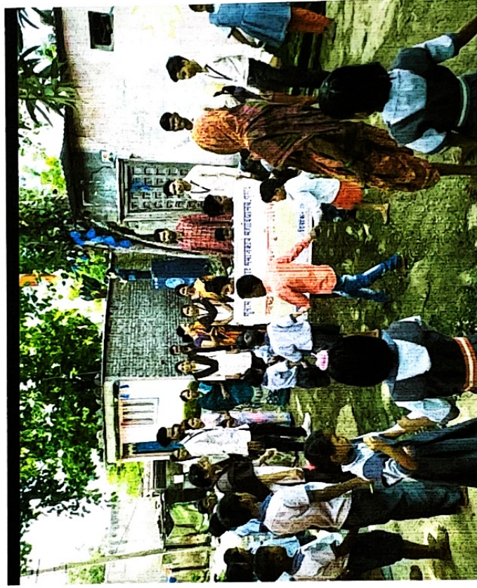
Cleanliness awareness Programme Jagr Z.P student