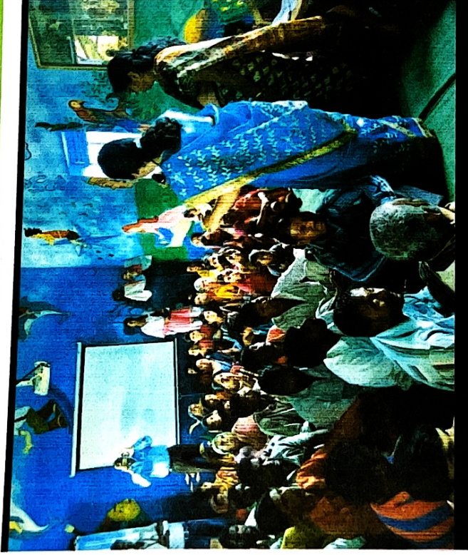
Cleanliness awareness Programme