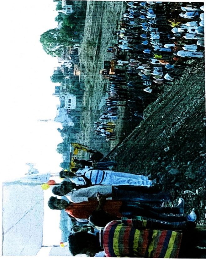
Cleanliness awareness Through Gramsabha