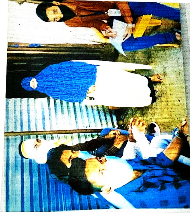
Mass distribution at .Pusad COVID-19