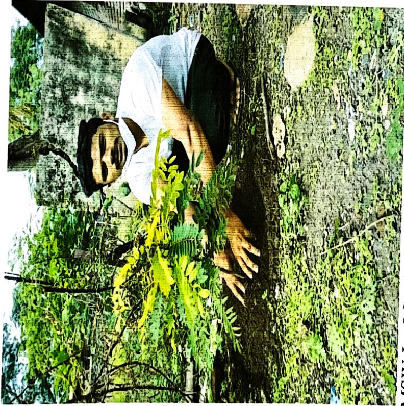
MSW-I - I Student