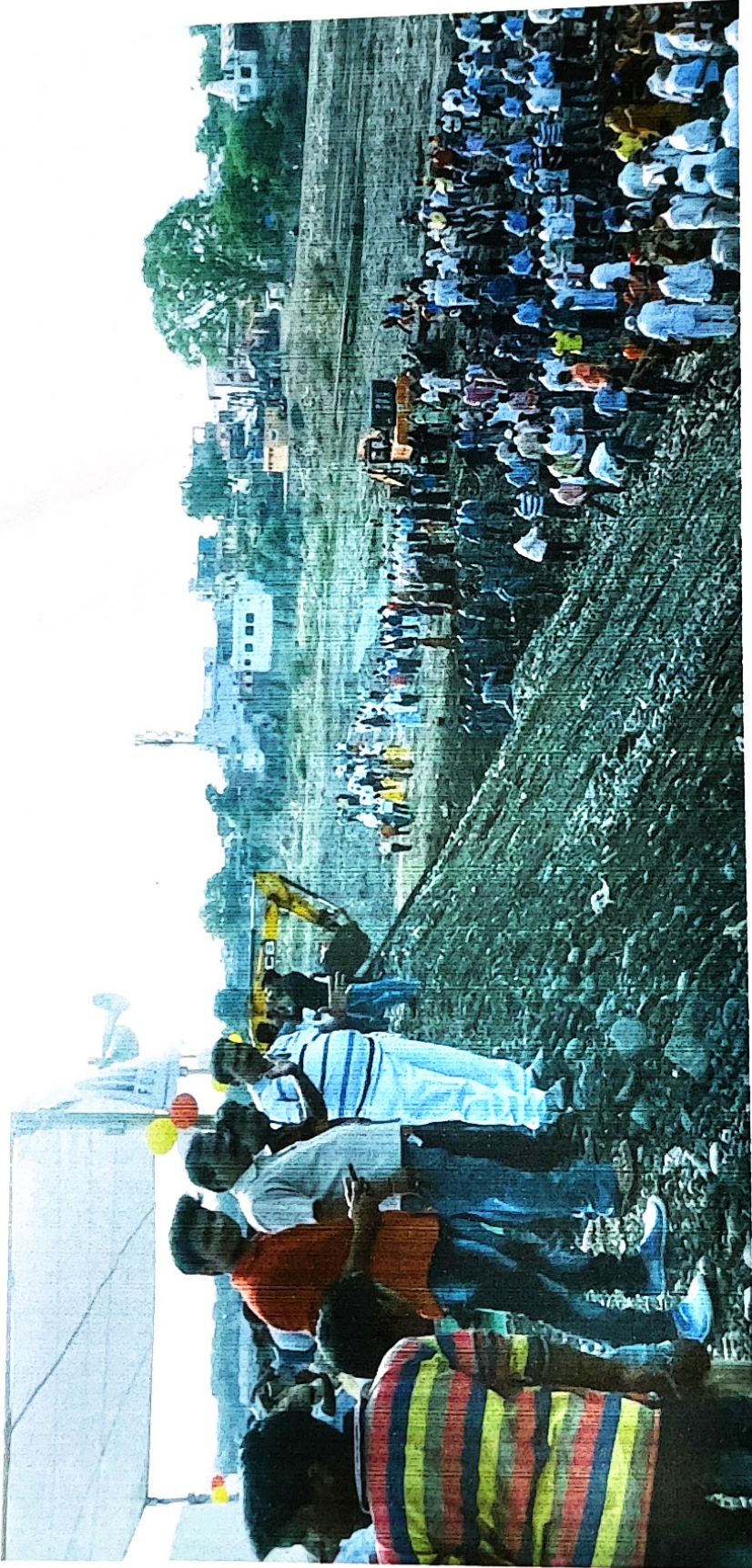
PUSE RIVER REVIVAL