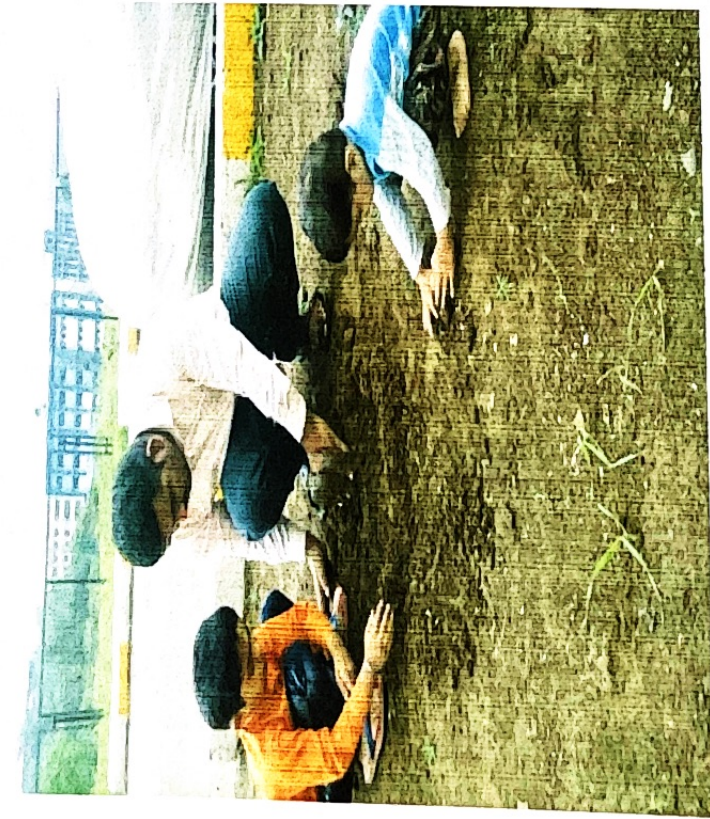
IndiraNagar Teacher & Student