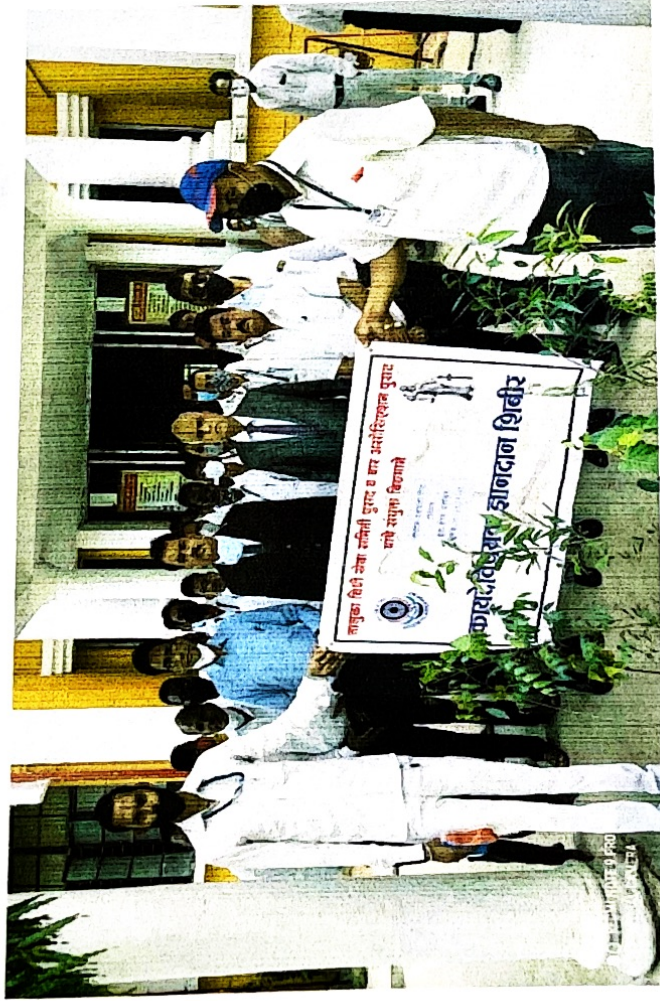
PLV One plant Campaign

पुस्तद/प्रतिनिधी सेवा समिती तालुका विधी सेवा समिती व जी एन. आझाद समाजकार्य महाविद्यालयाच्या वतीने "एक PLV - एक वृक्ष अभियान" शब्दविषयात श्रेत आहे. अभियानाचा पहिला टप्पा दि. १३ ते २१ जून २०२१ दरम्यान राबविण्यात आला. पहिल्या