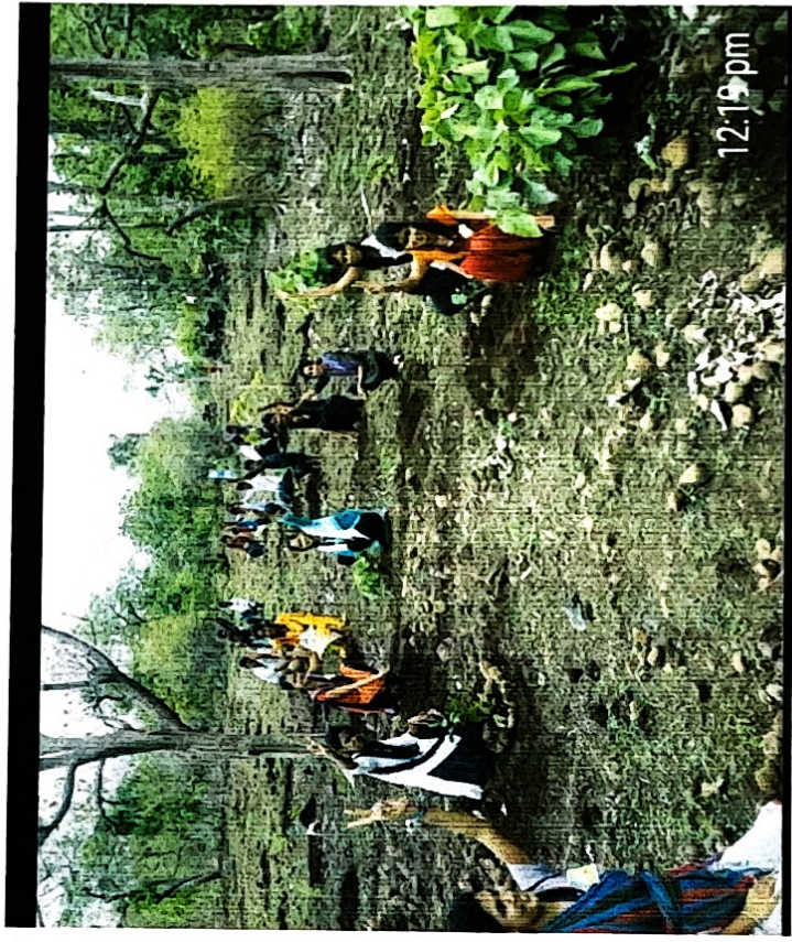
Mission Tree Plantation Campaign