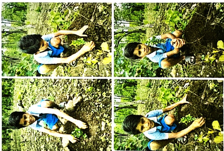
Tree plantation waltur Z.P.School student