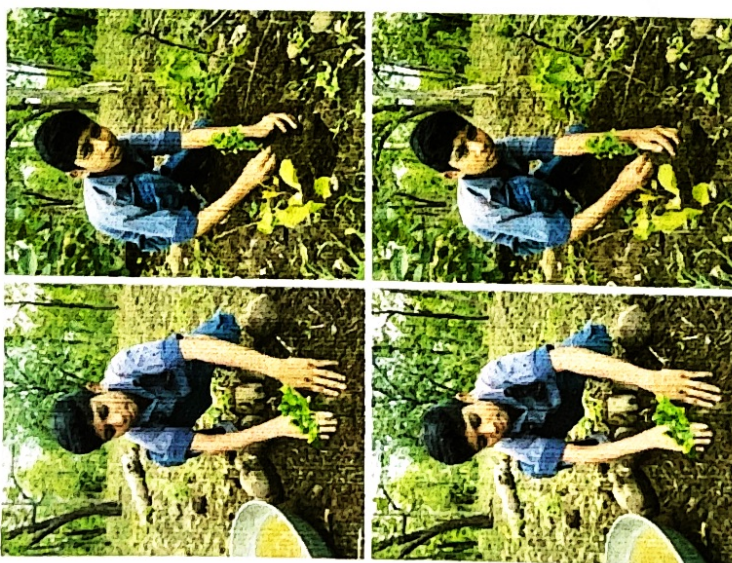
Tree plantation in village Sadwa Madwa