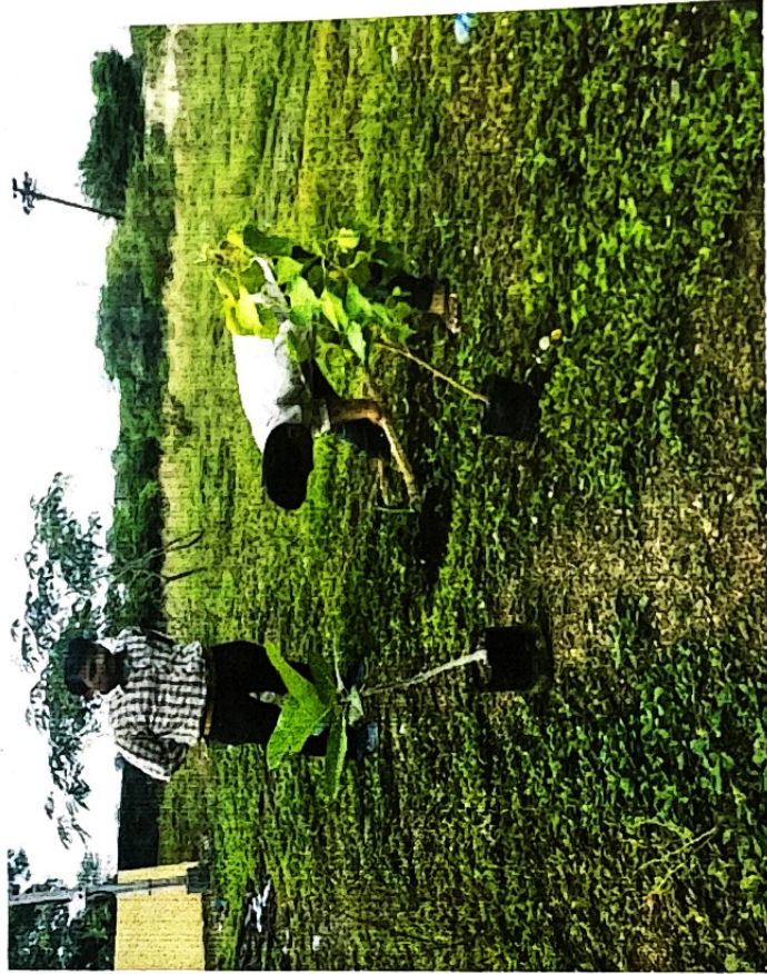
IndiraNagar Sarpanch & Student