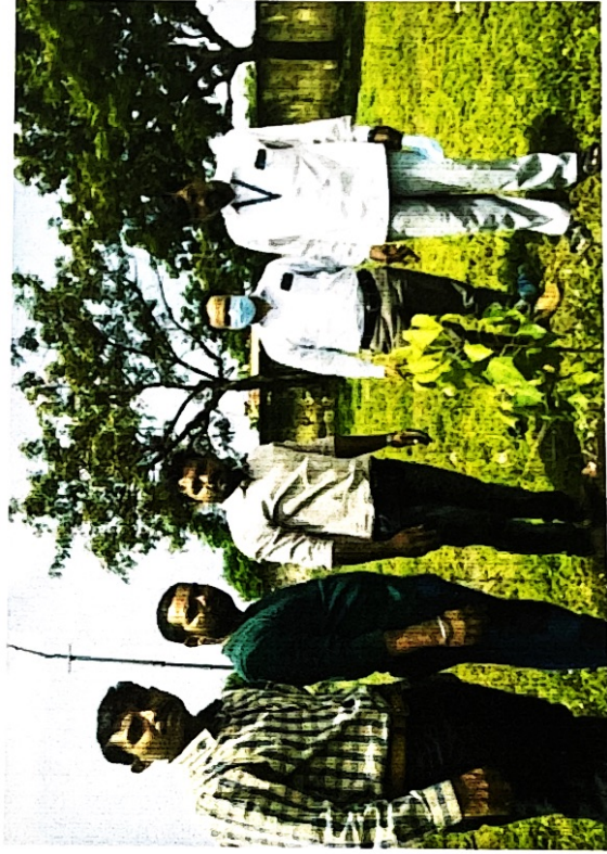
Tree plantation at village Sadwa -Mandwa