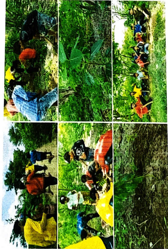
Place:-Inderanagar Khrshi village